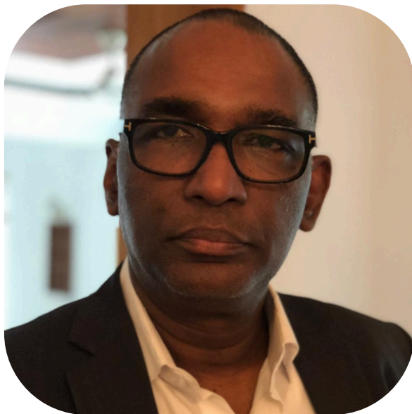
Hon'ble Mr. Justice J. Chelameswar